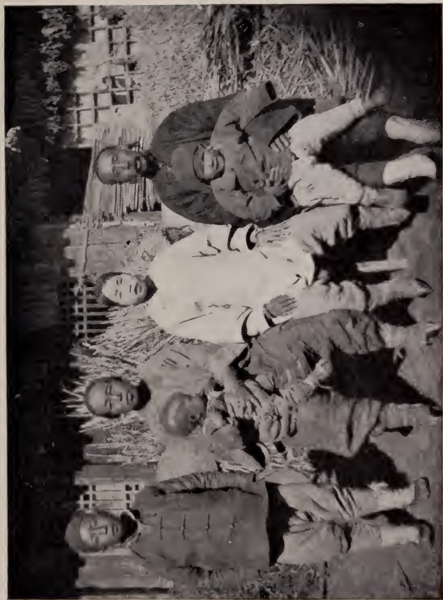
A CHINESE FAMILY.